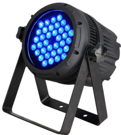
Rainproof : PQ818