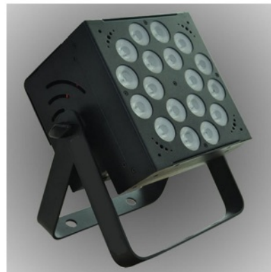
Indoor : WQ818

A powerful Pastel colors projector to light facades or stages over a long range. It has a low consumption, high luminance, it is stable and has a long lifespan.